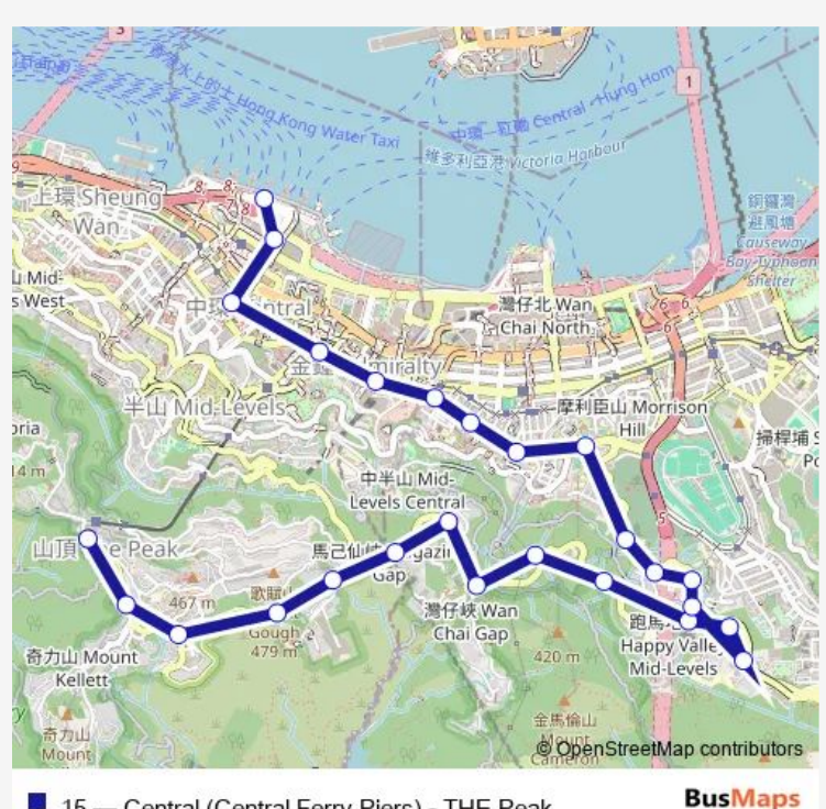
15 — Central (Central Ferry Piers) - THE Peak